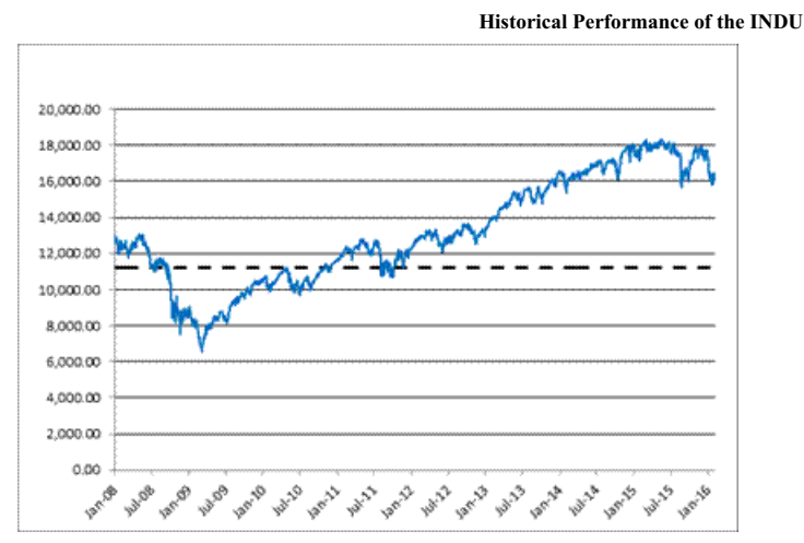
Before investing in the notes, you should consult publicly available sources for the levels of the INDU.

The following graph sets forth the daily historical performance of the INDU in the period from January 1, 2008 through February 8, 2016. This historical data on the INDU is not necessarily indicative of its future performance or what the value of the notes may be. Any historical upward or downward trend in the level of the INDU during any period set forth below is not an indication that the level of the INDU is more or less likely to increase or decrease at any time over the term of the notes. The horizontal line in the graph represents the hypothetical Threshold Value of 11,218.94, assuming a Starting Value of 16,027.05, which was the closing level of the INDU on February 8, 2016 (the actual Starting Value and Threshold Value of the INDU, which will be 70% of its Starting Value, will be determined on the pricing date).