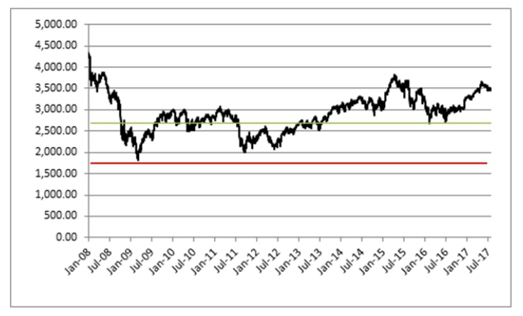
Before investing in the notes, you should consult publicly available sources for the levels of the SX5E.

The following graph sets forth the daily historical performance of the SX5E in the period from January 1, 2008 through July 28, 2017. This historical data on the SX5E is not necessarily indicative of its future performance or what the value of the notes may be. Any historical upward or downward trend in the level of the SX5E during any period set forth below is not an indication that the level of the SX5E is more or less likely to increase or decrease at any time over the term of the notes. The horizontal green line in the graph represents the hypothetical Coupon Barrier of 2,600.80 and the horizontal red line in the graph represents the hypothetical Threshold Value of 1,733.87, assuming a Starting Value of 3,467.73, which was the closing level of the SX5E on July 28, 2017 (the actual Starting Value, Coupon Barrier (75% of its Starting Value) and Threshold Value (50% of its Starting Value) of the SX5E will be determined on the pricing date).