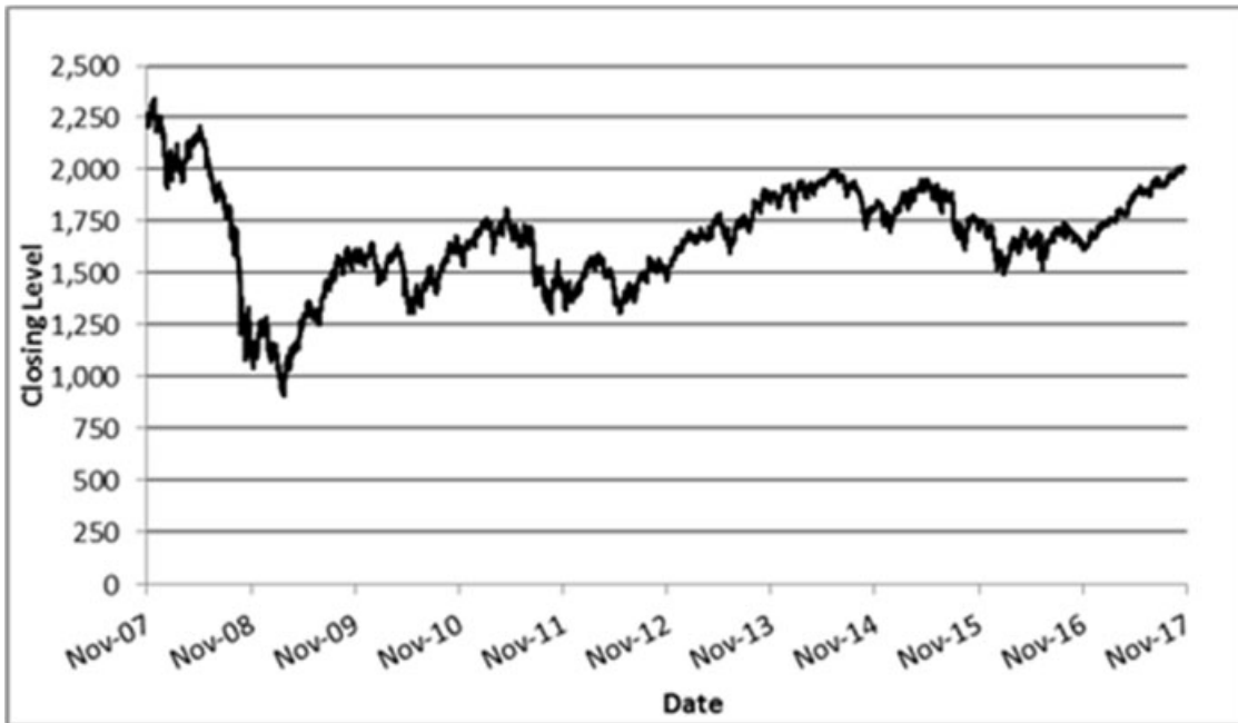
Historical Performance of the MSCI EAFE® Index

The graph below shows the daily historical closing levels of the Underlier from November 16, 2007 through November 16, 2017. We obtained the closing levels in the graph below from Bloomberg Financial Services, without independent verification. Although the official closing levels of the MSCI EAFE® Index are published to three decimal places by the Underlier Sponsor, Bloomberg Financial Services reports the levels of the MSCI EAFE® Index to fewer decimal places.