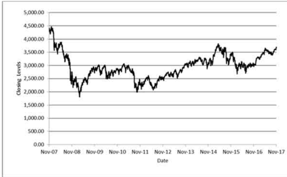
Historical Performance of the EURO STOXX 50® Index

The following graphs show the daily historical closing levels of the SX5E, the UKX, the TPX, the SMI and the AS51 from November 27, 2007 through November 27, 2017. The graphs are for illustrative purposes only. We obtained the closing levels of the Basket Underliers in the graphs below from Bloomberg Financial Services, without independent verification.