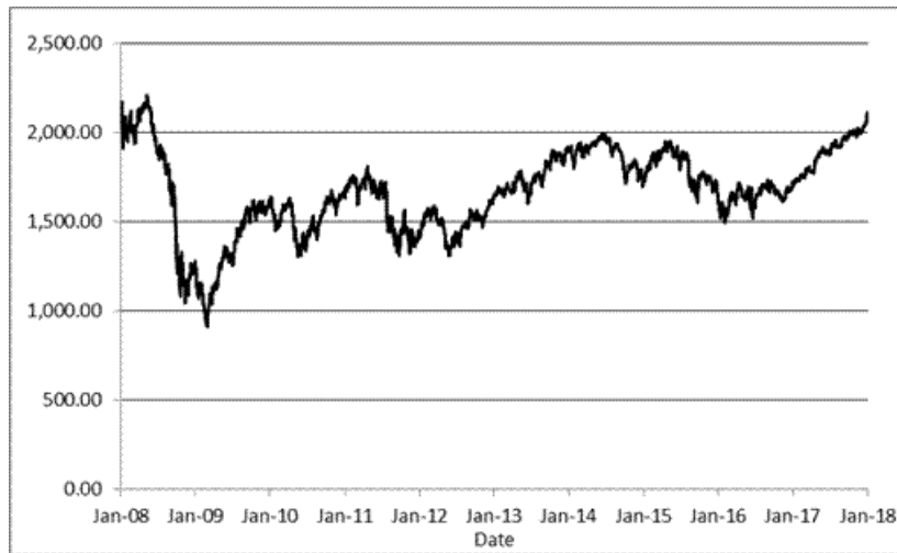
Historical Performance of the MSCI EAFE® Index

The graph below shows the daily historical closing levels of the Underlier from January 19, 2008 through January 19, 2018. We obtained the closing levels in the graph below from Bloomberg Financial Services, without independent verification. Although the official closing levels of the Underlier are published to three decimal places by the Underlier Sponsor, Bloomberg Financial Services reports the levels of the Underlier to fewer decimal places.