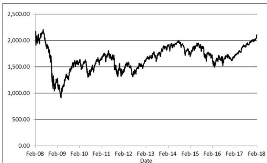
Historical Performance of the MSCI EAFE ® Index

The graph below shows the daily historical closing levels of the Underlier from February 1, 2008 through February 1, 2018. We obtained the closing levels in the graph below from Bloomberg Financial Services, without independent verification. Although the official closing levels of the MSCI EAFE ® Index are published to three decimal places by the Underlier Sponsor, Bloomberg Financial Services reports the levels of the MSCI EAFE ® Index to fewer decimal places.