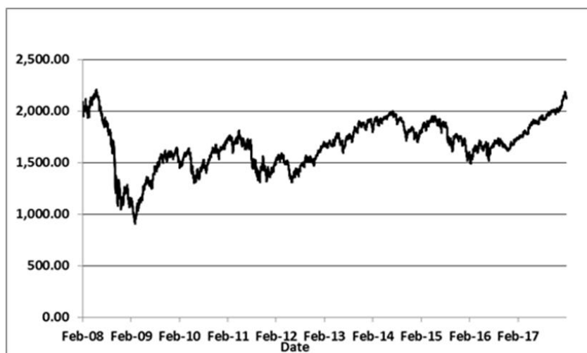
Historical Performance of the MSCI EAFE ® Index

The graph below shows the daily historical closing levels of the Underlier from February 6, 2008 through February 6, 2018. We obtained the closing levels in the graph below from Bloomberg Financial Services, without independent verification. Although the official closing levels of the MSCI EAFE ® Index are published to three decimal places by the Underlier Sponsor, Bloomberg Financial Services reports the levels of the MSCI EAFE ® Index to fewer decimal places.