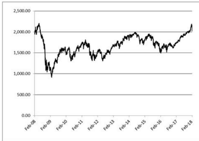
Historical Performance of the MSCI EAFE ® Index

The graph below shows the daily historical closing levels of the Underlier from February 8, 2008 through February 8, 2018. We obtained the closing levels in the graph below from Bloomberg Financial Services, without independent verification. Although the official closing levels of the MSCI EAFE ® Index are published to three decimal places by the Underlier Sponsor, Bloomberg Financial Services reports the levels of the MSCI EAFE ® Index to fewer decimal places.