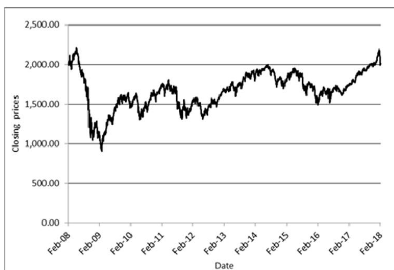
Historical Performance of the MSCI EAFE ® Index

The graph below shows the daily historical closing levels of the Underlier from February 12, 2008 through February 12, 2018. We obtained the closing levels in the graph below from Bloomberg Financial Services, without independent verification. Although the official closing levels of the MSCI EAFE ® Index are published to three decimal places by the Underlier Sponsor, Bloomberg Financial Services reports the levels of the MSCI EAFE ® Index to fewer decimal places.