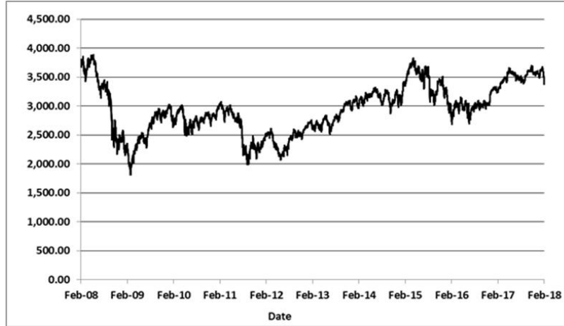
Historical Performance of the EURO STOXX 50® Index

The following graphs show the daily historical closing levels of the SX5E, the UKX, the TPX, the SMI and the AS51 from February 14, 2008 through February 14, 2018. The graphs are for illustrative purposes only. We obtained the closing levels of the Basket Underliers in the graphs below from Bloomberg Financial Services, without independent verification.