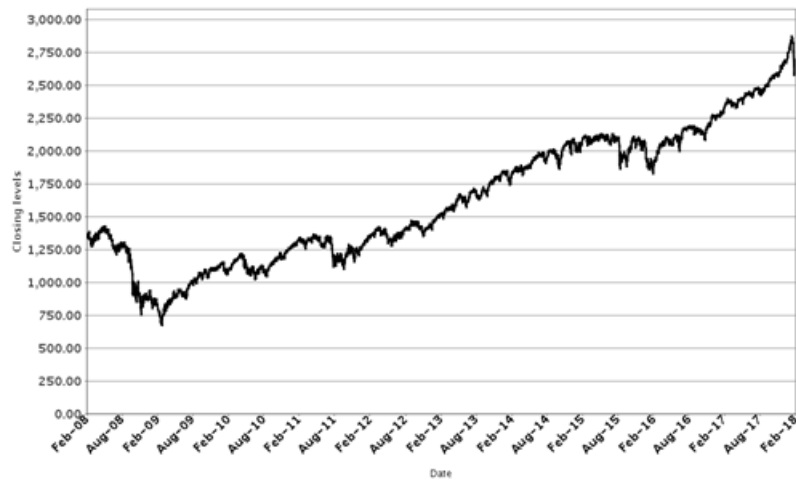
Historical Performance of the S&P 500® Index

The graph below shows the daily historical closing levels of the Underlier from February 14, 2008 through February 14, 2018. We obtained the closing levels in the graph below from Bloomberg Financial Services, without independent verification.