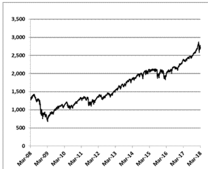
Historical Performance of the S&P 500® Index

The graph below shows the daily historical closing levels of the Underlier from March 6, 2008 through March 6, 2018. We obtained the closing levels in the graph below from Bloomberg Financial Services, without independent verification.