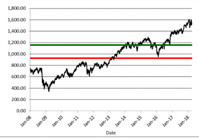
Before investing in the notes, you should consult publicly available sources for the levels of the RTY.

The following graph sets forth the daily historical performance of the RTY in the period from January 1, 2008 through the pricing date. This historical data on the RTY is not necessarily indicative of its future performance or what the value of the notes may be. Any historical upward or downward trend in the level of the RTY during any period set forth below is not an indication that the level of the RTY is more or less likely to increase or decrease at any time over the term of the notes. The horizontal green line in the graph represents the Coupon Barrier of 1,157.786, which is 75% of its Starting Value of 1,543.715, rounded to three decimal places, and the horizontal red line in the graph represents the Threshold Value of 926.229, which is 60% of its Starting Value of 1,543.715.