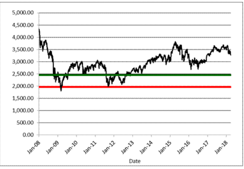
Before investing in the notes, you should consult publicly available sources for the levels of the SX5E.

The following graph sets forth the daily historical performance of the SX5E in the period from January 1, 2008 through the pricing date. This historical data on the SX5E is not necessarily indicative of its future performance or what the value of the notes may be. Any historical upward or downward trend in the level of the SX5E during any period set forth below is not an indication that the level of the SX5E is more or less likely to increase or decrease at any time over the term of the notes. The horizontal green line in the graph represents the Coupon Barrier of 2,459.04, which is 75% of its Starting Value of 3,278.72, and the horizontal red line in the graph represents the Threshold Value of 1,967.23, which is 60% of its Starting Value of 3,278.72, rounded to two decimal places.