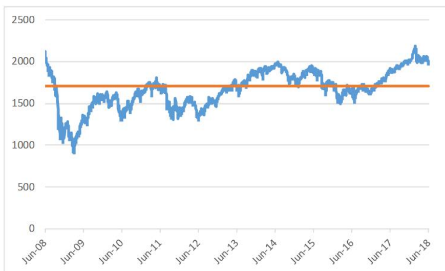
Historical Performance of the MSCI EAFE ® Index

The graph below shows the daily historical closing levels of the Underlier from June 6, 2008 through June 6, 2018. We obtained the closing levels in the graph below from Bloomberg Financial Services, without independent verification. Bloomberg Financial Services reports the levels of the MSCI EAFE ® Index to fewer decimal places than the Underlier Sponsor.