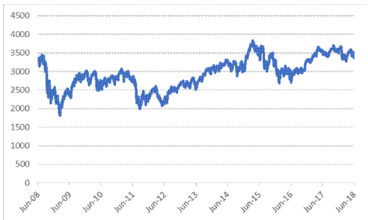
Historical Performance of the EURO STOXX 50® Index

The following graphs show the daily historical closing levels of the SX5E, the UKX, the TPX, the SMI, and the AS51 from June 29, 2008 through June 29, 2018. The graphs are for illustrative purposes only. We obtained the closing levels of the Basket Underliers in the graphs below from Bloomberg Financial Services, without independent verification.