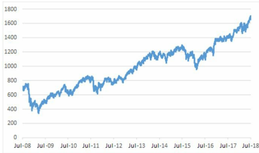
Historical Performance of the Russell 2000® Index

The graph below shows the daily historical closing levels of the Underlier from July 2, 2008 through July 2, 2018. We obtained the closing levels in the graph below from Bloomberg Financial Services, without independent verification. Bloomberg Financial Services reports the level of the Underlier to fewer decimal places than the Underlier Sponsor.