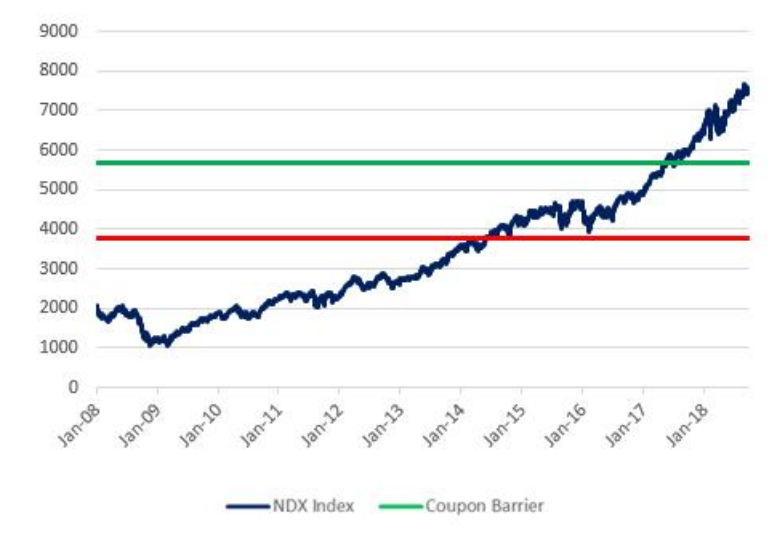
Before investing in the notes, you should consult publicly available sources for the levels of the NDX.

The following graph sets forth the daily historical performance of the NDX in the period from January 1, 2008 through the pricing date. This historical data on the NDX is not necessarily indicative of its future performance or what the value of the notes may be. Any historical upward or downward trend in the level of the NDX during any period set forth below is not an indication that the level of the NDX is more or less likely to increase or decrease at any time over the term of the notes. The horizontal red line in the graph represents the Threshold Value of 3,781.597, which is 50% of the Starting Value of 7,563.194. The horizontal green line in the graph represents the Coupon Barrier of 5,672.396, which is 75% of the Starting Value, rounded to three decimal places.