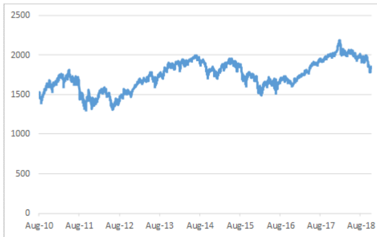
Historical Performance of the MSCI EAFE ® Index

The graph below shows the daily historical closing levels of the Underlier from November 10, 2008 through November 9, 2018. We obtained the closing levels in the graph below from Bloomberg Financial Services, without independent verification. Bloomberg Financial Services reports the levels of the MSCI EAFE ® Index to fewer decimal places than the Underlier Sponsor.