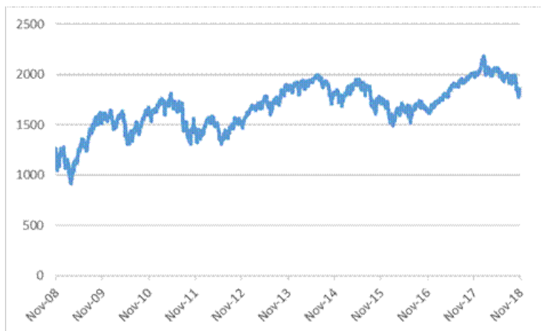
Historical Performance of the MSCI EAFE® Index

The graph below shows the daily historical closing levels of the Underlier from November 14, 2008 through November 14, 2018. We obtained the closing levels in the graph below from Bloomberg Financial Services, without independent verification. Bloomberg Financial Services reports the levels of the MSCI EAFE® Index to fewer decimal places than the Underlier Sponsor.