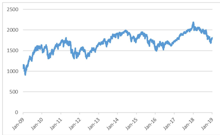
Historical Performance of the MSCI EAFE® Index

The graph below shows the daily historical closing levels of the Underlier from January 28, 2009 through January 28, 2019. We obtained the closing levels in the graph below from Bloomberg Financial Services, without independent verification. Bloomberg Financial Services reports the levels of the MSCI EAFE® Index to fewer decimal places than the Underlier Sponsor.