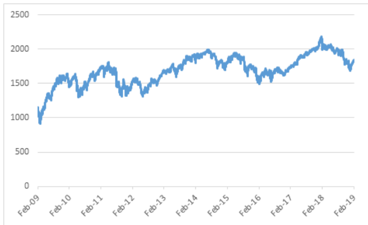
Historical Performance of the MSCI EAFE ® Index

The graph below shows the daily historical closing levels of the Underlier from February 6, 2009 through February 6, 2019. We obtained the closing levels in the graph below from Bloomberg Financial Services, without independent verification. Bloomberg Financial Services reports the levels of the MSCI EAFE ® Index to fewer decimal places than the Underlier Sponsor.