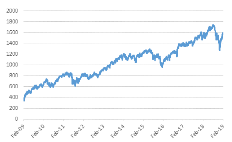
Historical Performance of the Russell 2000® Index

The graph below shows the daily historical closing levels of the Underlier from February 27, 2009 through February 27, 2019. We obtained the closing levels in the graph below from Bloomberg Financial Services, without independent verification. Currently, Bloomberg Financial Services reports the closing level of the Underlier to fewer decimal places than the Underlier Sponsor. As a result, the closing level of the Underlier reported by Bloomberg Financial Services may be lower or higher than its official closing level published by the Underlier Sponsor.