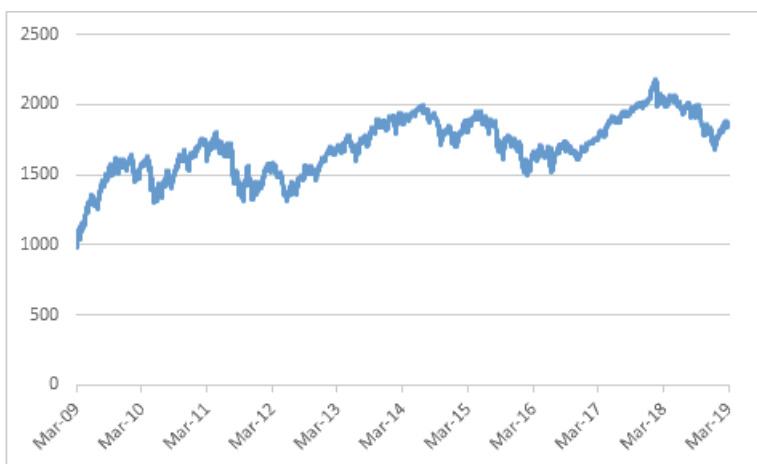
Historical Performance of the MSCI EAFE ® Index

The graph below shows the daily historical closing levels of the Underlier from March 14, 2009 through March 14, 2019. We obtained the closing levels in the graph below from Bloomberg Financial Services, without independent verification. Bloomberg Financial Services reports the levels of the MSCI EAFE ® Index to fewer decimal places than the Underlier Sponsor.