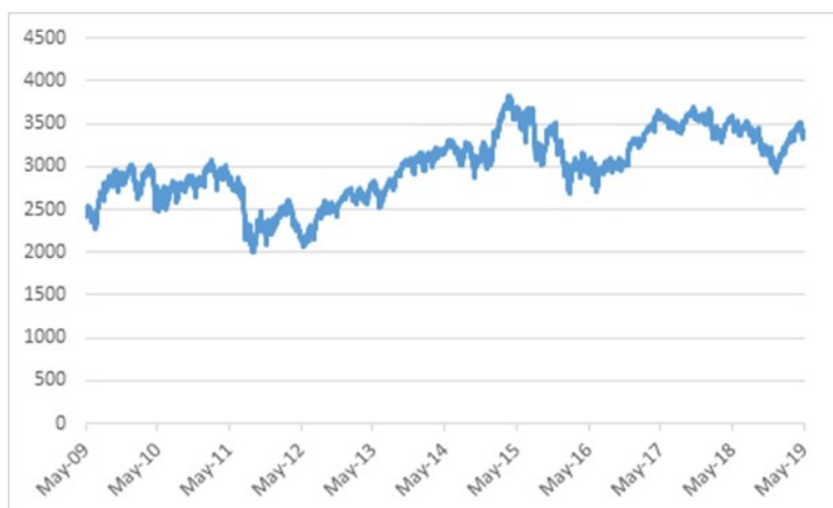
Historical Performance of the EURO STOXX 50® Index

The graph below shows the daily historical closing levels of the Underlier from May 20, 2009 through May 20, 2019. We obtained the closing levels in the graph below from Bloomberg Financial Services, without independent verification.