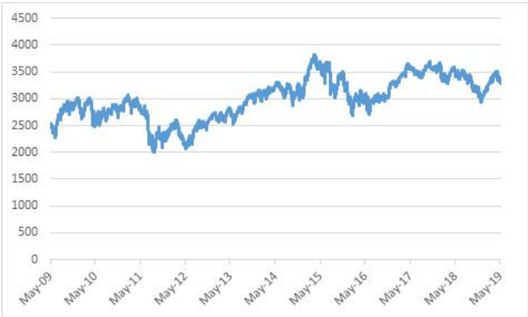
Historical Performance of the EURO STOXX 50® Index

The graph below shows the daily historical closing levels of the Underlier from May 31, 2009 through May 31, 2019. We obtained the closing levels in the graph below from Bloomberg Financial Services, without independent verification.