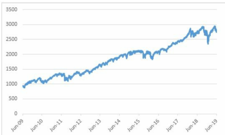
Historical Performance of the S&P 500® Index

The graph below shows the daily historical closing levels of the Underlier from June 4, 2009 through June 4, 2019. We obtained the closing levels in the graph below from Bloomberg Financial Services, without independent verification.