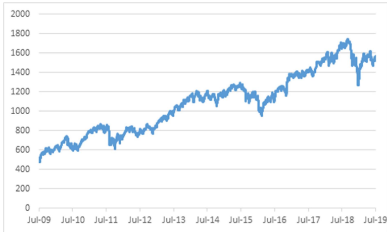
Historical Performance of the Russell 2000® Index

The graph below shows the daily historical closing levels of the Underlier from July 1, 2009 through July 1, 2019. We obtained the closing levels in the graph below from Bloomberg Financial Services, without independent verification. Currently, Bloomberg Financial Services reports the closing level of the Underlier to fewer decimal places than the Underlier Sponsor. As a result, the closing level of the Underlier reported by Bloomberg Financial Services may be lower or higher than its official closing level published by the Underlier Sponsor.