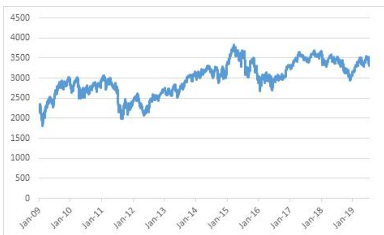
Historical Performance of the EURO STOXX 50® Index

The graph below shows the daily historical closing levels of the Underlier from August 5, 2009 through August 5, 2019. We obtained the closing levels in the graph below from Bloomberg Financial Services, without independent verification.