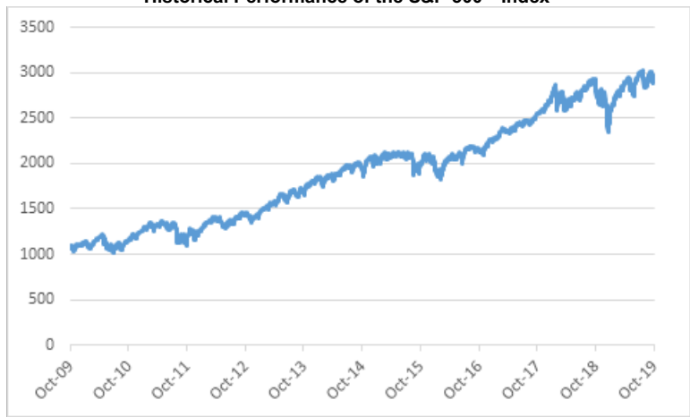
Historical Performance of the S&P 500® Index