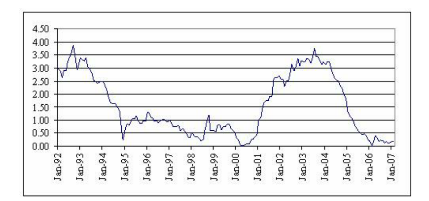
Movements in CMS30 and CMS2 are imperfectly correlated to movements in the 30-Year Treasury Rate and 2-Year Treasury Rate, respectively. The first graph below reflects the correlation between the month-end CMS30 relative to the month-end 30-Year Treasury Rate during the period from January 1992 to February 2007; the second graph reflects the correlation between the month-end CMS2 relative to the month-end 2-Year Treasury Rate during the same period.