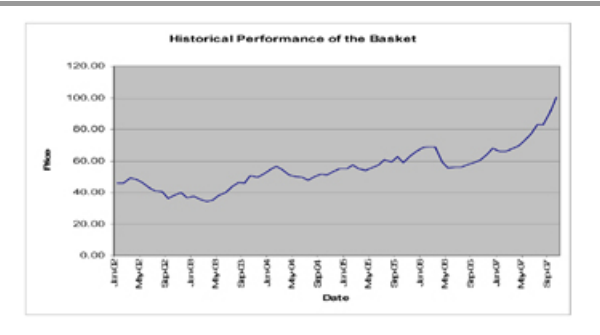
Historical Information about the Basket Component Indices