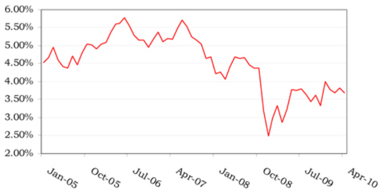
Historical Performance of CMS10

The following graph sets forth the historical month-end levels of CMS10 presented in the preceding table. On April 30, 2010, the level of CMS10 was 3.682%.