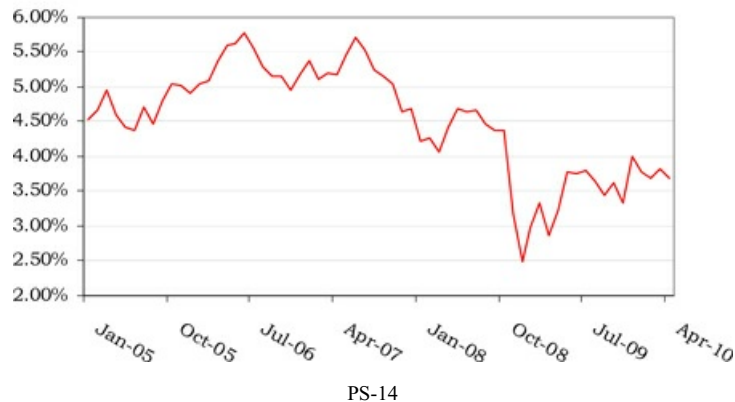
Historical Performance of CMS10

The following graph sets forth the historical month-end levels of CMS10 presented in the preceding table. On May 11, 2010, the level of CMS10 was 3.600%.