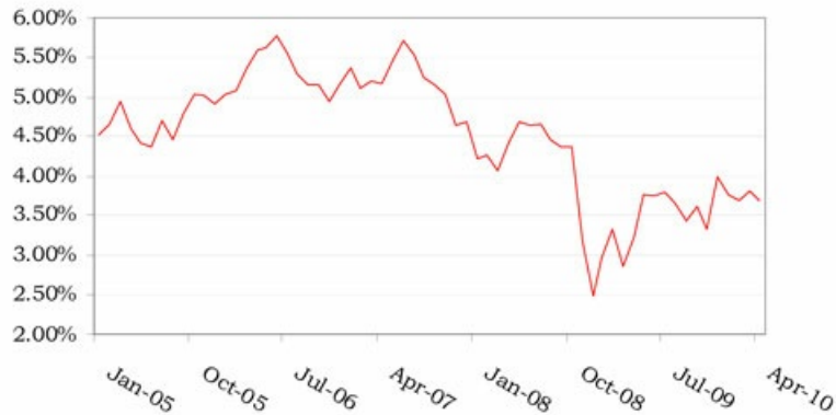
Historical Performance of CMS10

The following graph sets forth the historical month-end levels of CMS10 presented in the preceding table. On the pricing date, the level of CMS10 was 3.593%.