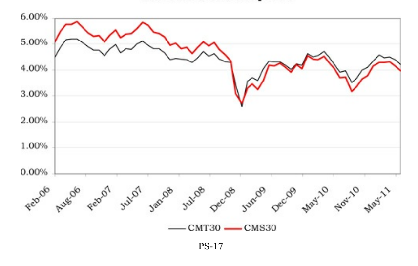
UST-Yield & USD Swap-Yield

Movements in CMS30 and CMS2 have historically been correlated to some extent, but not exactly, to movements in the 30-year Constant Maturity Treasury Rate and 2-year Constant Maturity Treasury Rate, respectively. The first graph below reflects the month-end CMS30 relative to the month-end 30-year Constant Maturity Treasury Rate during the period from January 2006 through May 2011 (the 30-year Constant Maturity Treasury Rate was discontinued on February 18, 2002 and reintroduced on February 9, 2006); the second graph reflects the month-end CMS2 relative to the month-end 2-year Constant Maturity Treasury Rate during the same period.