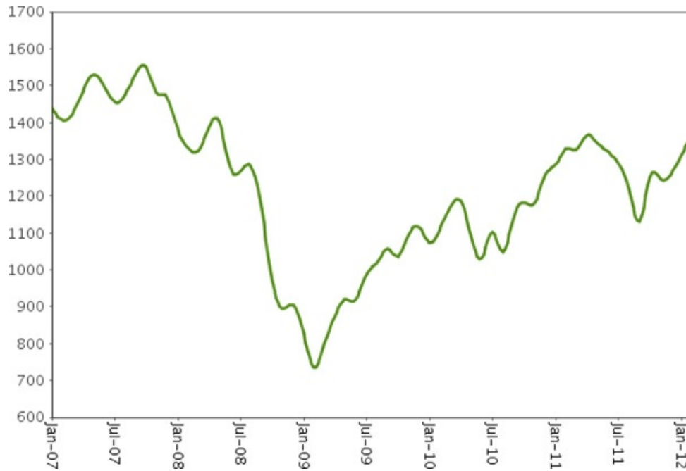
Historical Performance of the Index

This historical data on the Index is not necessarily indicative of the future performance of the Index or what the value of the notes may be. Any historical upward or downward trend in the level of the Index during any period set forth above is not an indication that the level of the Index is more or less likely to increase or decrease at any time over the term of the notes.