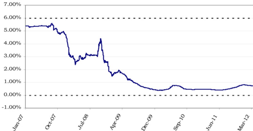
Historical Levels of the Reference Rate

The historical data on the Reference Rate presented above is not necessarily indicative of the future performance of the Reference Rate or what the value of the notes may be. The historical data sets forth only month-end levels of the Reference Rate. Interest accruing on the notes is determined in reference to daily levels of the Reference Rate. Any month-end trend in the level of the Reference Rate is not necessarily indicative of the intra-month trends. Furthermore, any historical upward or downward trend in the level of the Reference Rate during any period set forth above is not an indication that the level of the Reference Rate is more or less likely to increase or decrease at any time over the term of the notes.