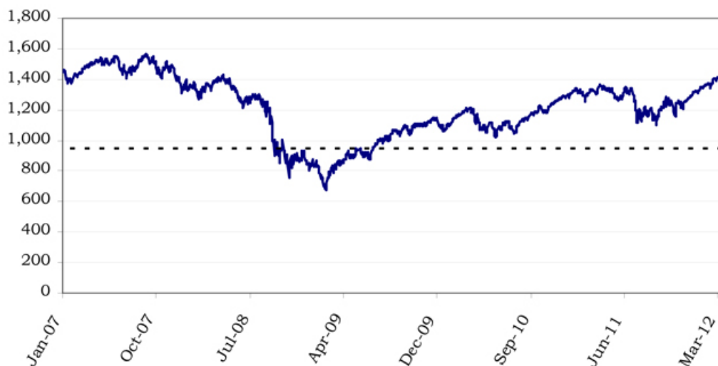
Historical Levels of the Reference Index

The historical data on the Reference Index presented above is not necessarily indicative of the future performance of the Reference Index or what the value of the notes may be. The historical data sets forth only month-end closing levels of the Reference Index. Interest accruing on the notes is determined in reference to daily closing levels of the Reference Index. Any month-end trend in the level of the Reference Index is not necessarily indicative of the intra-month trends. Furthermore, any historical upward or downward trend in the level of the Reference Index during any period set forth above is not an indication that the level of the Reference Index is more or less likely to increase or decrease at any time over the term of the notes.