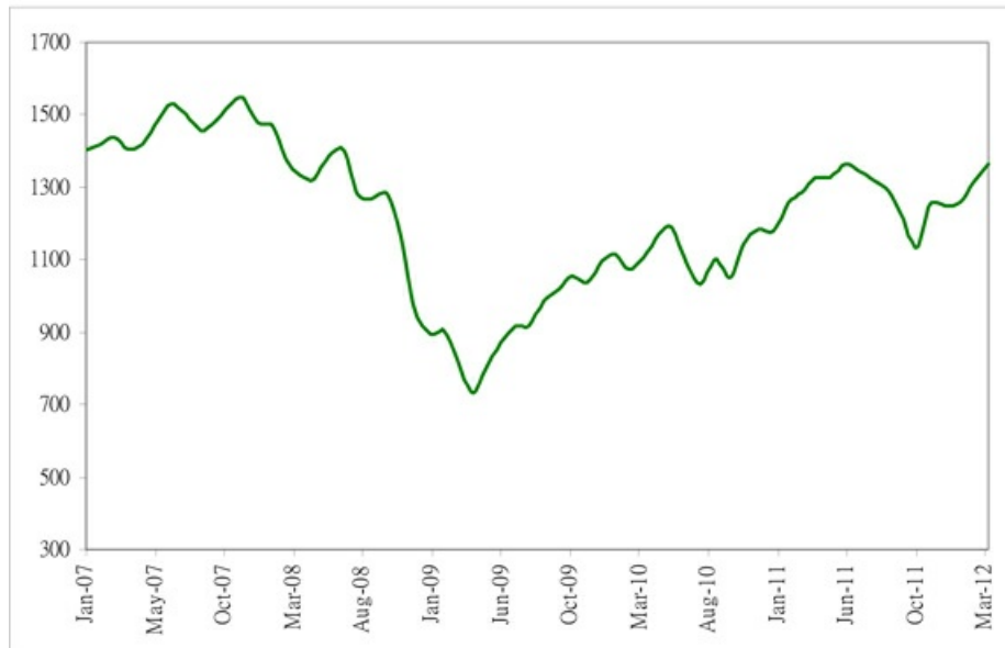
Historical Performance of the Index

This historical data on the Index is not necessarily indicative of the future performance of the Index or what the value of the notes may be. Any historical upward or downward trend in the level of the Index during any period set forth above is not an indication that the level of the Index is more or less likely to increase or decrease at any time over the term of the notes.