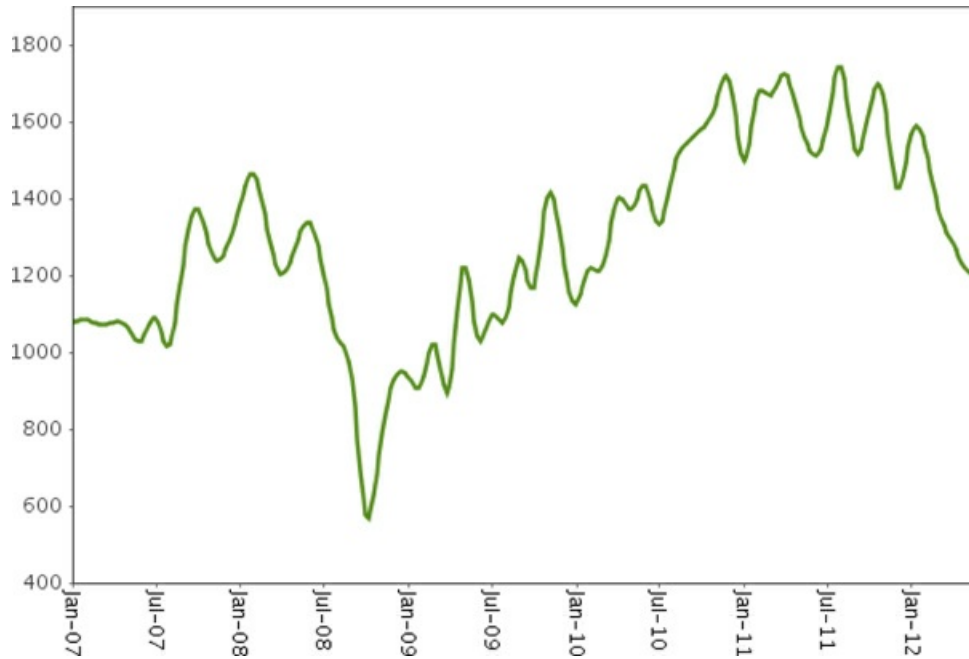
Historical Performance of the Index

This historical data on the Index is not necessarily indicative of the future performance of the Index or what the value of the notes may be. Any historical upward or downward trend in the level of the Index during any period set forth above is not an indication that the level of the Index is more or less likely to increase or decrease at any time over the term of the notes.