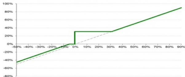
Market-Linked Step Up Notes

This graph reflects the returns on the notes, based on a Step Up Payment of $3.00 (the midpoint of the Step Up Payment range of [$2.70 to $3.30]), a Step Up Value of 130% of the Starting Value (the midpoint of the Step Up Value range of [127% to 133%]), and a Threshold Value of 95% of the Starting Value. The green line reflects the returns on the notes, while the dotted gray line reflects the returns of a direct investment in the Index, excluding dividends.