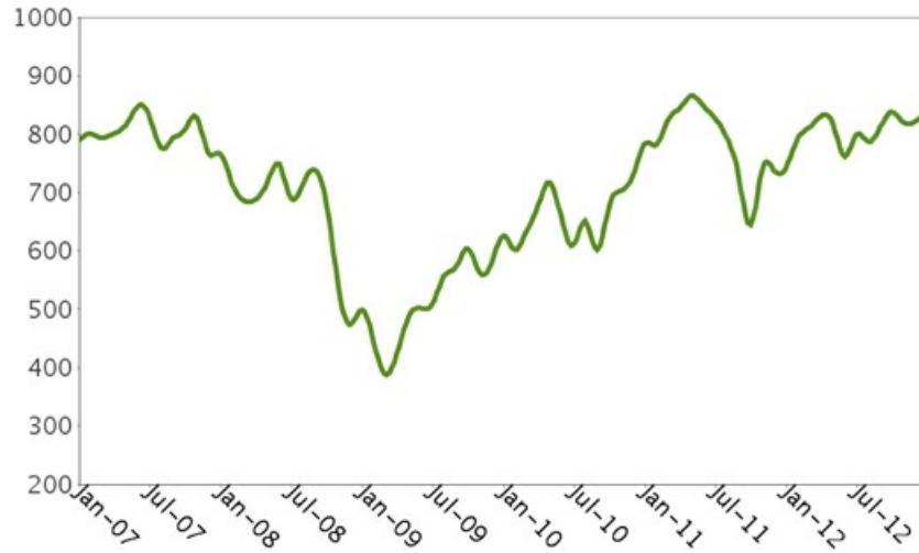
Historical Performance of the Index

This historical data on the Index is not necessarily indicative of the future performance of the Index or what the value of the notes may be. Any historical upward or downward trend in the level of the Index during any period set forth above is not an indication that the level of the Index is more or less likely to increase or decrease at any time over the term of the notes.