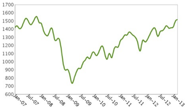
Historical Performance of the Index

This historical data on the Index is not necessarily indicative of the future performance of the Index or what the value of the notes may be. Any historical upward or downward trend in the level of the Index during any period set forth above is not an indication that the level of the Index is more or less likely to increase or decrease at any time over the term of the notes.