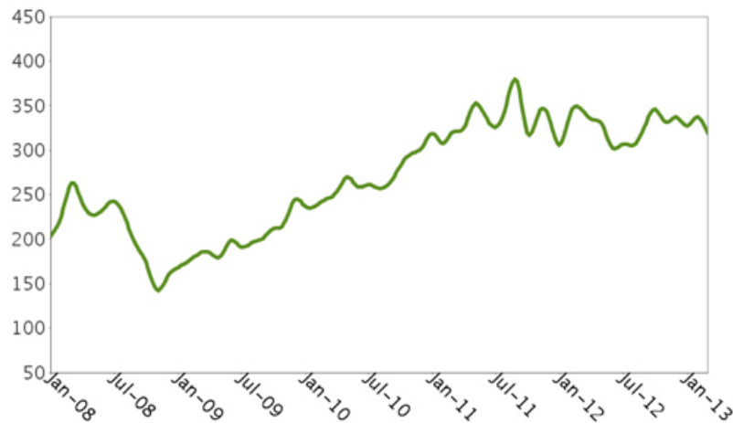
Hypothetical Historical and Historical Performance of the Index

This hypothetical historical and historical data on the Index is not necessarily indicative of the future performance of the Index or what the value of the notes may be. Any hypothetical historical or historical upward or downward trend in the level of the Index during any period set forth above is not an indication that the level of the Index is more or less likely to increase or decrease at any time over the term of the notes.