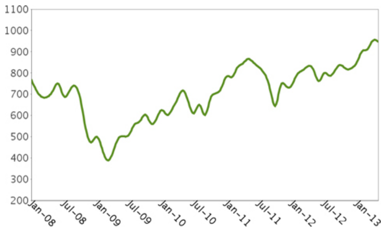
Historical Performance of the Russell 2000 ® Index

This historical data on the Russell 2000 ® Index is not necessarily indicative of the future performance of the Russell 2000 ® Index or what the value of the notes may be. Any historical upward or downward trend in the level of the Russell 2000 ® Index during any period set forth above is not an indication that the level of the Russell 2000 ® Index is more or less likely to increase or decrease at any time over the term of the notes.