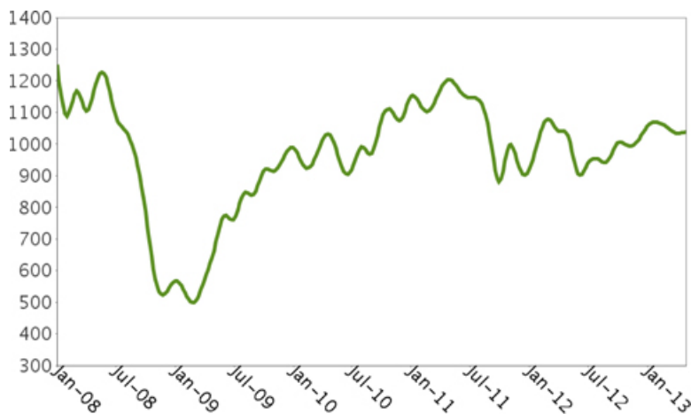
Historical Performance of the MSCI Emerging Markets Index

This historical data on the MSCI Emerging Markets Index is not necessarily indicative of the future performance of the MSCI Emerging Markets Index or what the value of the notes may be. Any historical upward or downward trend in the level of the MSCI Emerging Markets Index during any period set forth below is not an indication that the level of the MSCI Emerging Markets Index is more or less likely to increase or decrease at any time over the term of the notes.