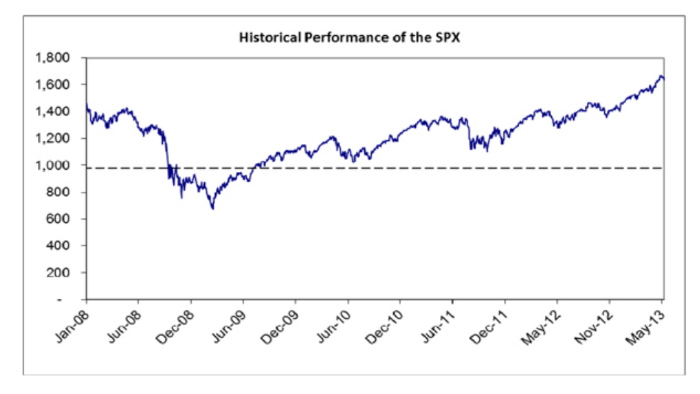
Before investing in the notes, you should consult publicly available sources for the levels and trading pattern of the SPX.