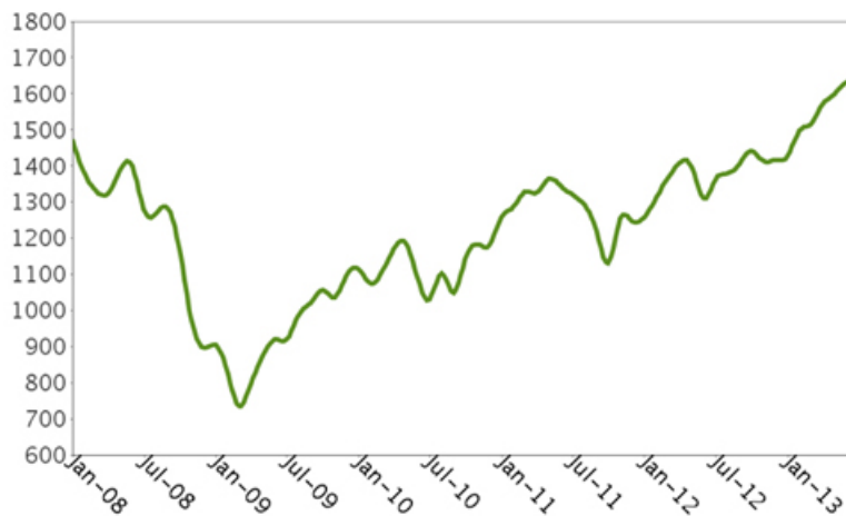
Historical Performance of the Index

This historical data on the Index is not necessarily indicative of the future performance of the Index or what the value of the notes may be. Any historical upward or downward trend in the level of the Index during any period set forth above is not an indication that the level of the Index is more or less likely to increase or decrease at any time over the term of the notes.