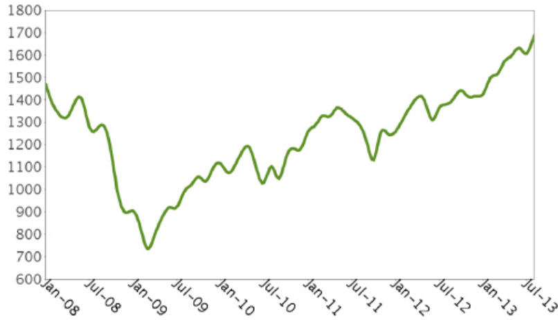
Historical Performance of the Index

This historical data on the Index is not necessarily indicative of the future performance of the Index or what the value of the notes may be. Any historical upward or downward trend in the level of the Index during any period set forth above is not an indication that the level of the Index is more or less likely to increase or decrease at any time over the term of the notes.