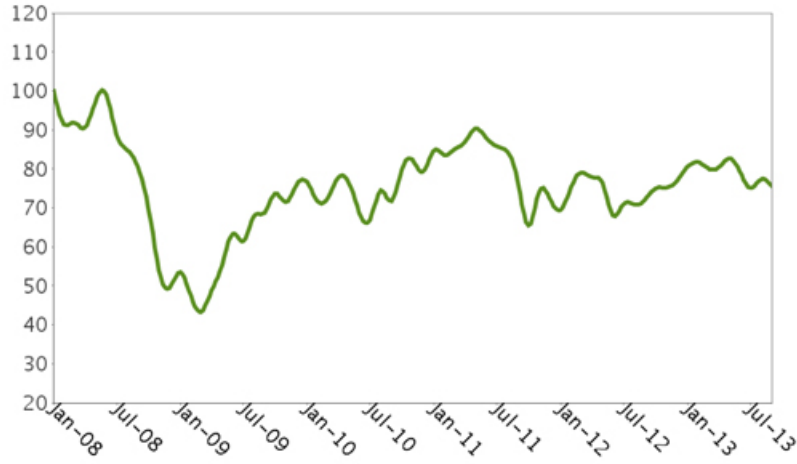
Historical Performance of the Basket

While actual historical information on the Basket will not exist before the pricing date, the following graph sets forth the hypothetical historical monthly performance of the Basket from January 2008 through August 2013. The graph is based upon actual month-end historical prices of the Basket Components, hypothetical Component Ratios based on the closing levels of the Basket Components as of December 31, 2007, and a Basket value of 100.00 as of that date. This hypothetical historical data on the Basket is not necessarily indicative of the future performance of the Basket or what the value of the notes may be. Any historical upward or downward trend in the value of the Basket during any period set forth below is not an indication that the value of the Basket is more or less likely to increase or decrease at any time over the term of the notes.