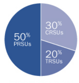
2014 CEO Variable Pay Mix